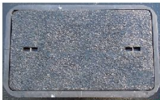
Pro-Line Fittings NEW IC Lid in a Double driveway Box