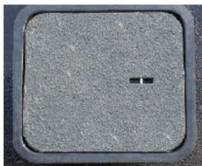
Pro-Line Fittings NEW IC Lid in a Single Driveway Box